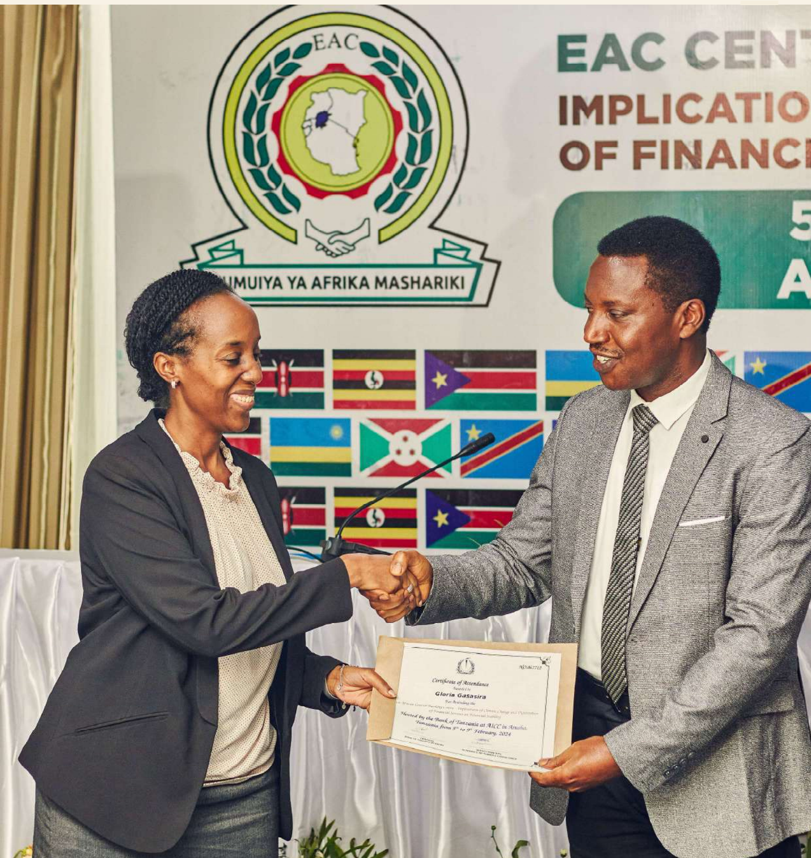
Participant from the Bank of Uganda (on the left) receiving Certificate of Participation during The EAC Central Banking course held at the Arusha International Conference Center (AICC) in Tanzania

For more Information: Tel: 255 (028) 2500709 / 2500983 | Mob: +255 766 222 541 | Fax: +255 (028) 2500984