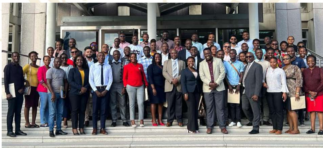
Participants of Regulatory Requirements for Microfinance Services Providers Course held at BOT Sub-head office Dar es Salaam Tanzania

For more Information: Tel: 255 (028) 2500709 / 2500983 | Mob: +255 766 222 541 | Fax: +255 (028) 2500984