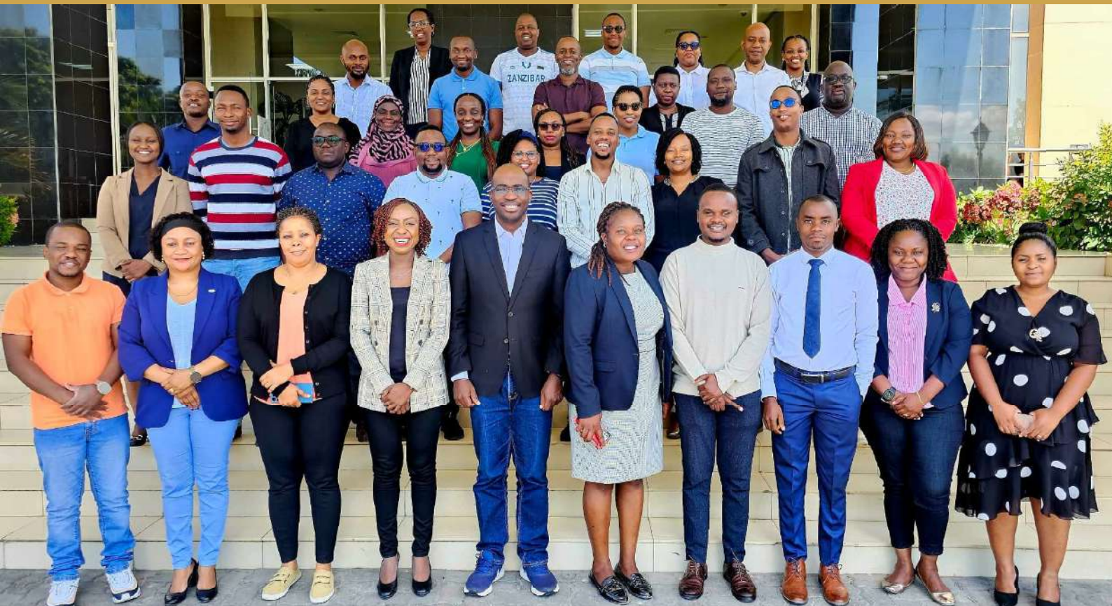
Group photo of participants during Climate-Related Financial Risks Management Course held at BOT Head Office, Dodoma Tanzania

For more Information: Tel: 255 (028) 2500709 / 2500983 | Mob: +255 766 222 541 | Fax: +255 (028) 2500984