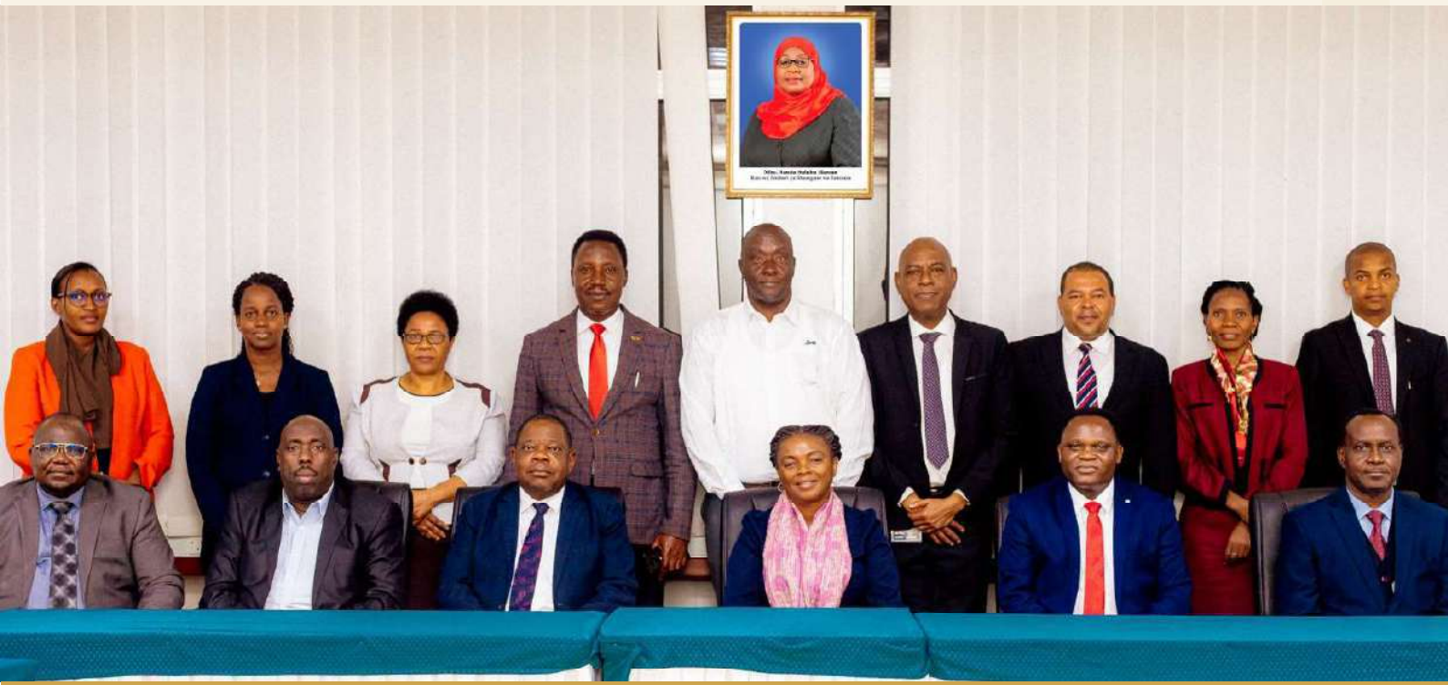
A group photo of some of the Bank of Tanzania Academy Advisory Board members, Facilitator (seated, far left) and other participants during the Corporate Governance and Leadership training held at the BOT Arusha Tanzania