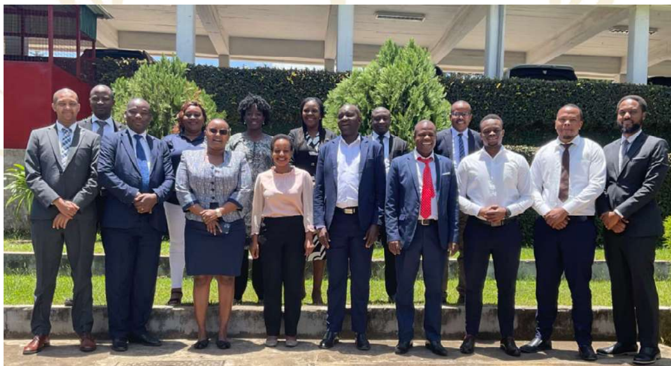
Group photo of the participants from EAC Countries who attended a course on Public Debt Management held at the Bank of Tanzania Arusha Branch, Tanzania

For more Information: Tel: 255 (028) 2500709 / 2500983 | Mob: +255 766 222 541 | Fax: +255 (028) 2500984