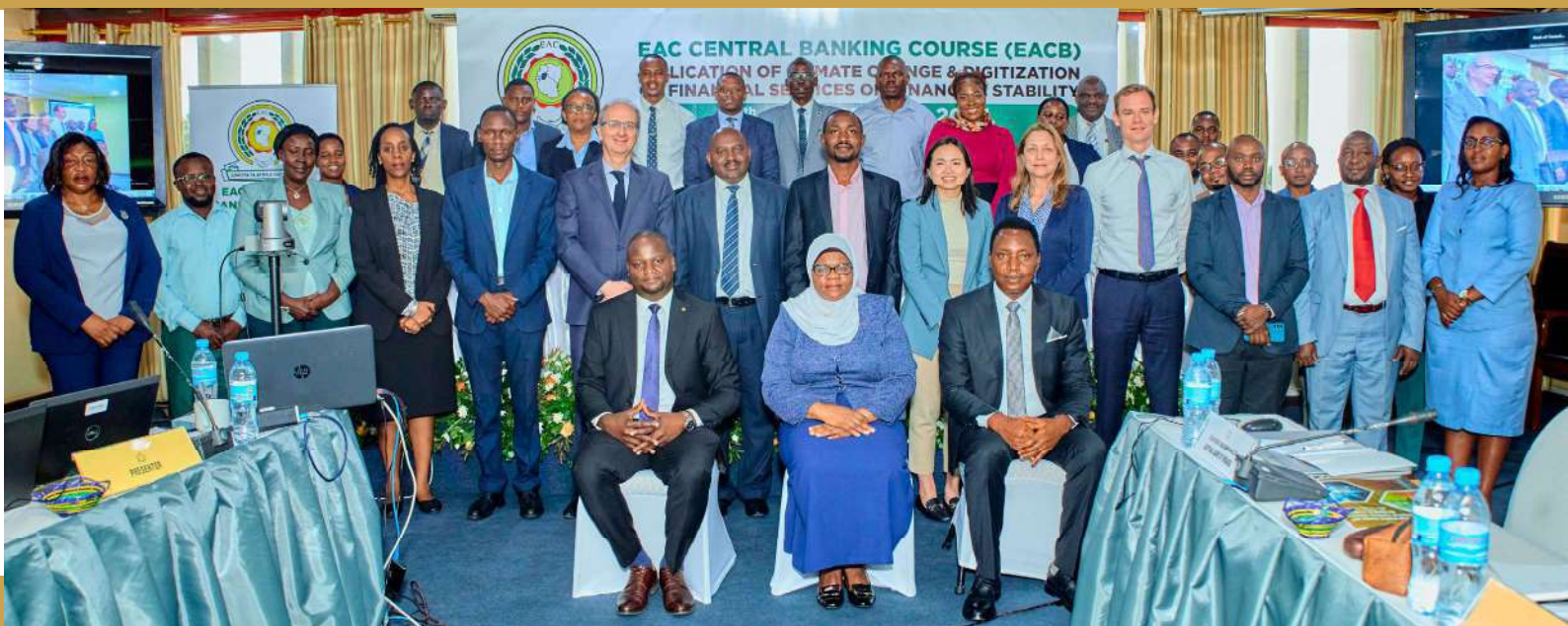
A group photo of participants at the EAC Central Banking Course held at the Arusha International Conference Centre (AICC) in Tanzania

For more Information: Tel: 255 (028) 2500709 / 2500983 | Mob: +255 766 222 541 | Fax: +255 (028) 2500984