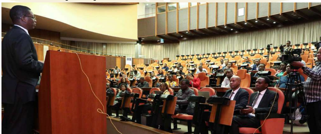
Emmanuel Tutuba, Governor of the Bank of Tanzania, officiating the opening of Microfinance Certification course, held at the Bank of Tanzania Sub-head office in Dar es Salaam Tanzania

For more Information: Tel: 255 (028) 2500709 / 2500983 | Mob: +255 766 222 541 | Fax: +255 (028) 2500984