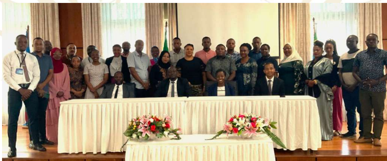
Group photo of participants during the Detection and Combating of Counterfeit Currency course held at the BOT Sub-Head office in Zanzibar Tanzania

For more Information: Tel: 255 (028) 2500709 / 2500983 | Mob: +255 766 222 541 | Fax: +255 (028) 2500984