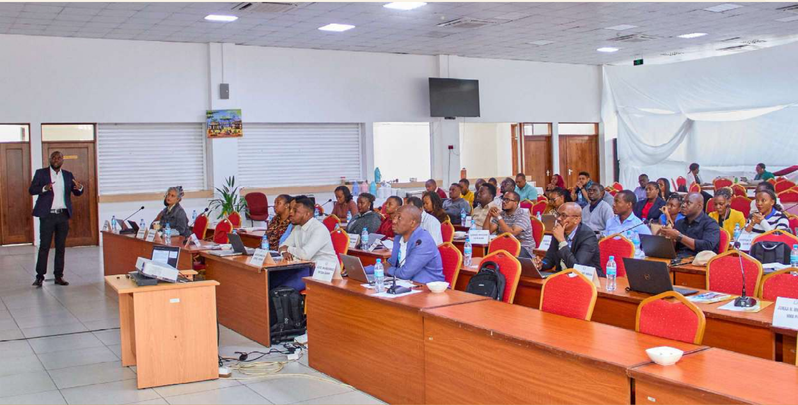
Participants attending class session during Tanzania Instant Payment System (TIPS) held at BOT, Arusha Branch Tanzania