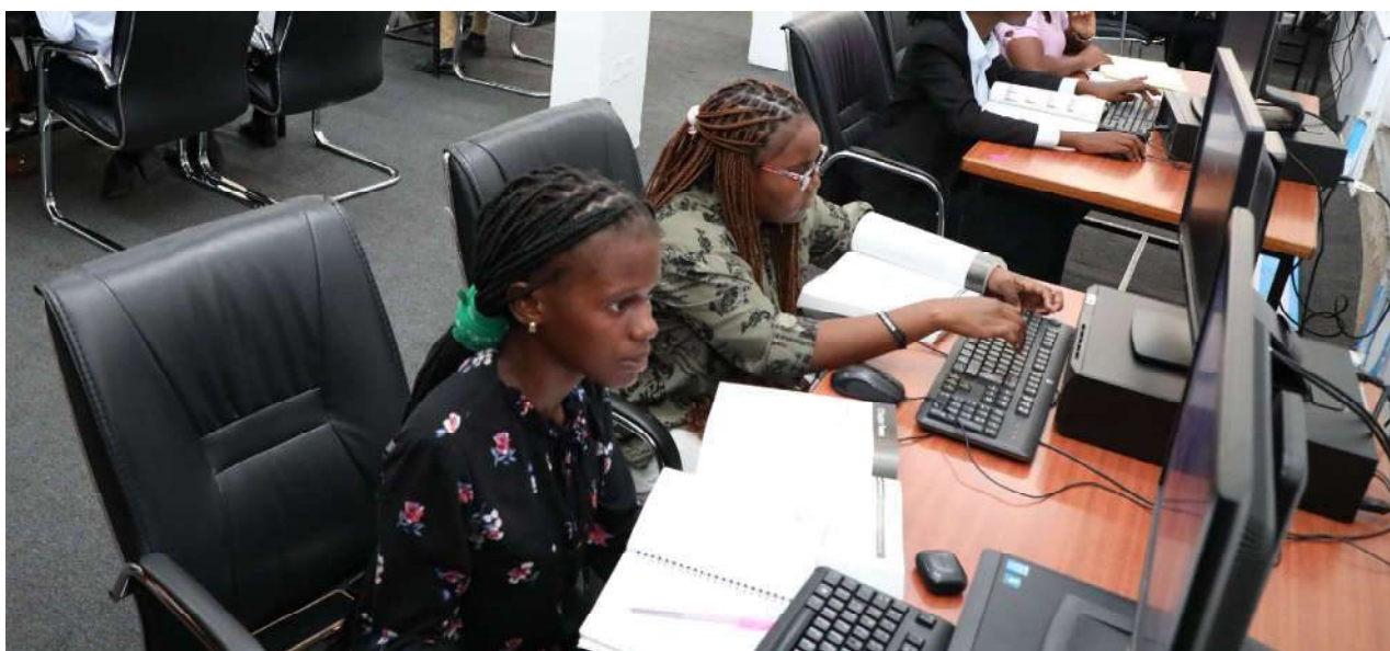
Diploma Students in Banking Practice and Supervision during their studies in the Academy's Library