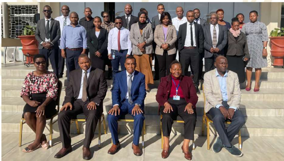
Group photo of BOT Management and Participants from the Bank of Tanzania, Financial Institutions and Law Enforcement Agencies who attended a Certified Currency Management Professional Programme held at the Bank of Tanzania, Mbeya Branch Tanzania

For more Information: Tel: 255 (028) 2500709 / 2500983 | Mob: +255 766 222 541 | Fax: +255 (028) 2500984