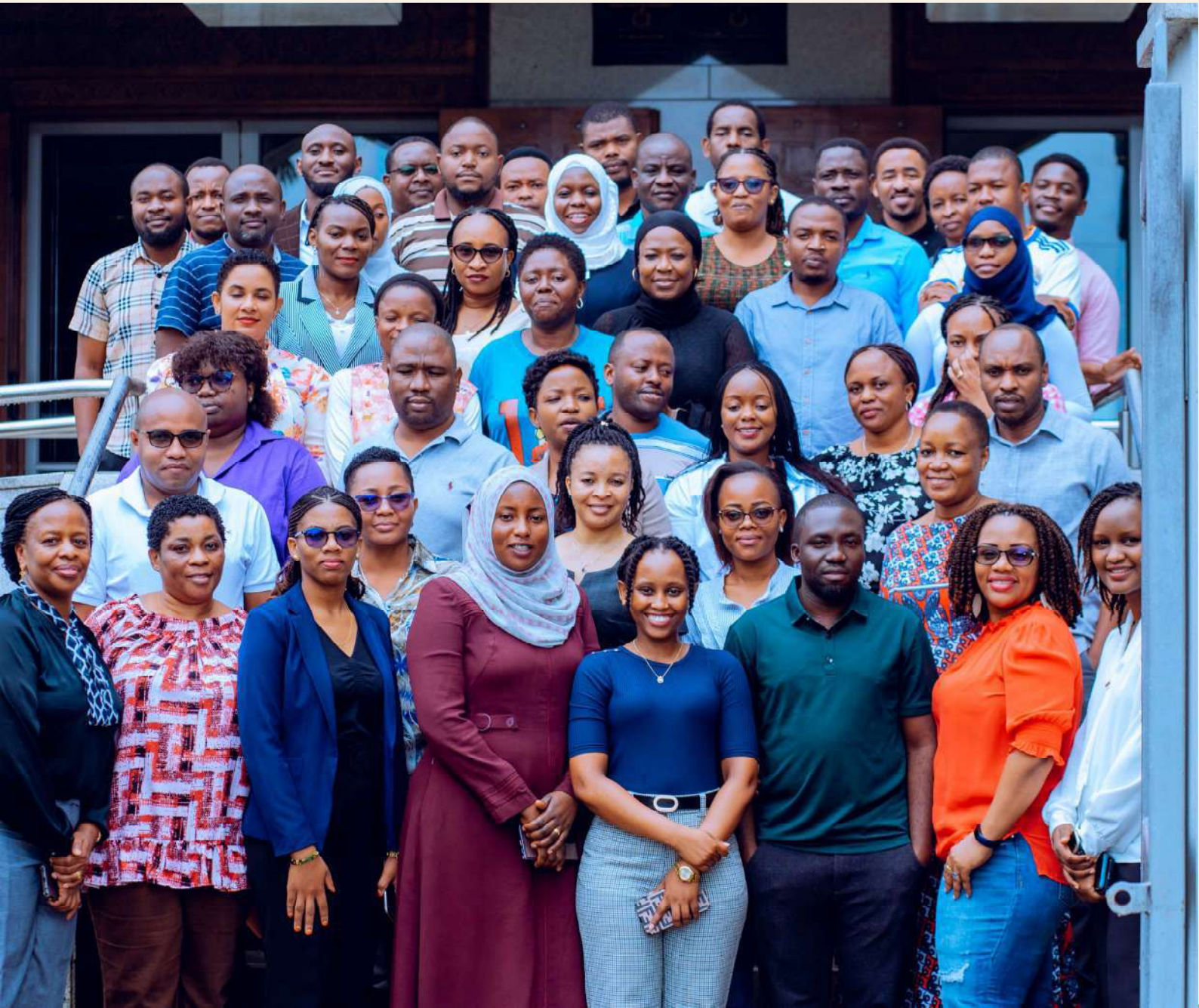
Group photo of participants of the Payment Systems - TISS and TACH from Banks and Financial Institutions held at BOT Sub-Head office in Zanzibar Tanzania

For more Information: Tel: 255 (028) 2500709 / 2500983 | Mob: +255 766 222 541 | Fax: +255 (028) 2500984