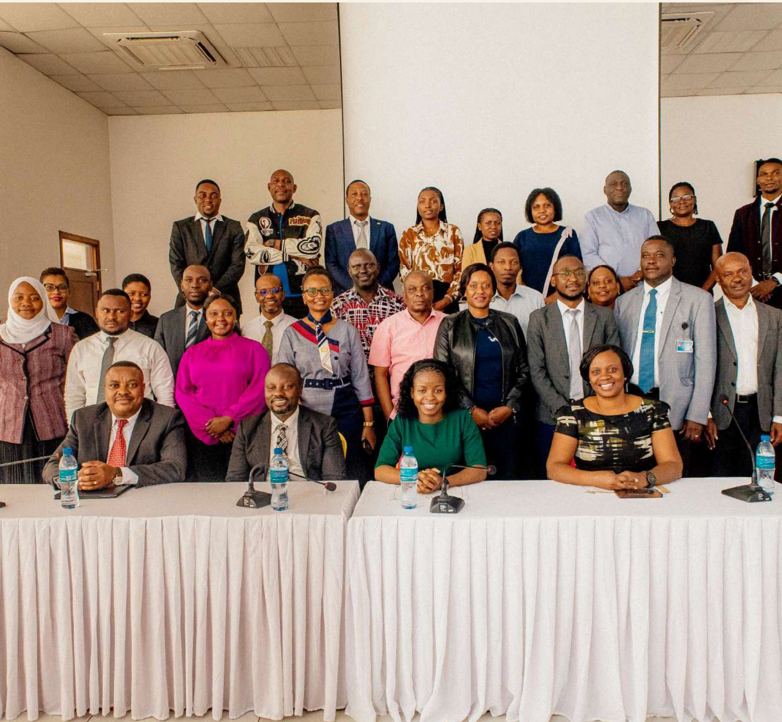
Group photo of the participants from Tanzania, Uganda and Zimbabwe who attended a course on the Anti-Money Laundering Course and Combating Terrorism, which was conducted at the BOT, Arusha Tanzania

For more Information: Tel: 255 (028) 2500709 / 2500983 | Mob: +255 766 222 541 | Fax: +255 (028) 2500984