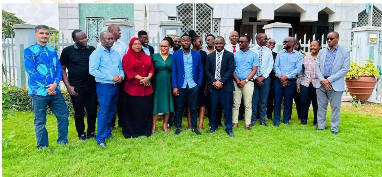
Participants of Treasury Management and Financial Markets Course held at BOT Sub-head office Zanzibar Tanzania

For more Information: Tel: 255 (028) 2500709 / 2500983 | Mob: +255 766 222 541 | Fax: +255 (028) 2500984