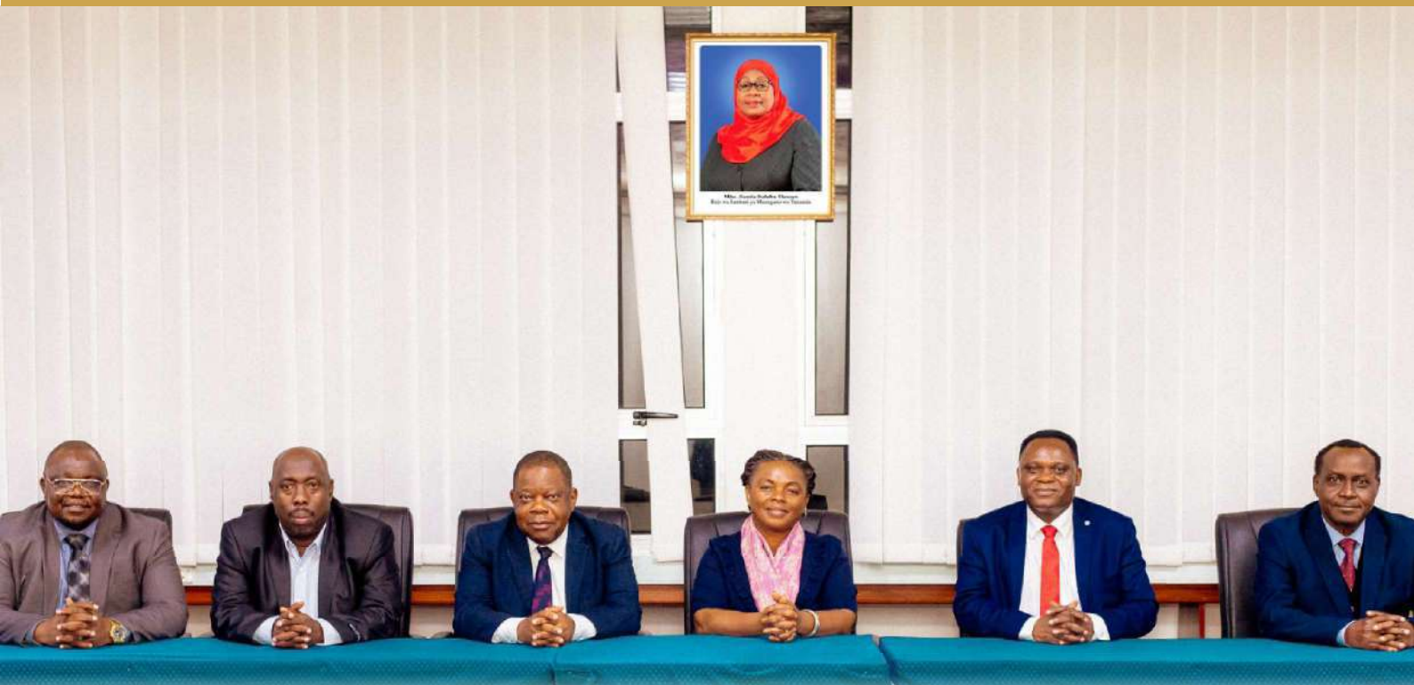
A group photo of some of the Bank of Tanzania Academy Advisory Board members and Facilitator(far left) during the Corporate Governance and Leadership training held at the BOT Arusha Tanzania

For more Information: Tel: 255 (028) 2500709 / 2500983 | Mob: +255 766 222 541 | Fax: +255 (028) 2500984