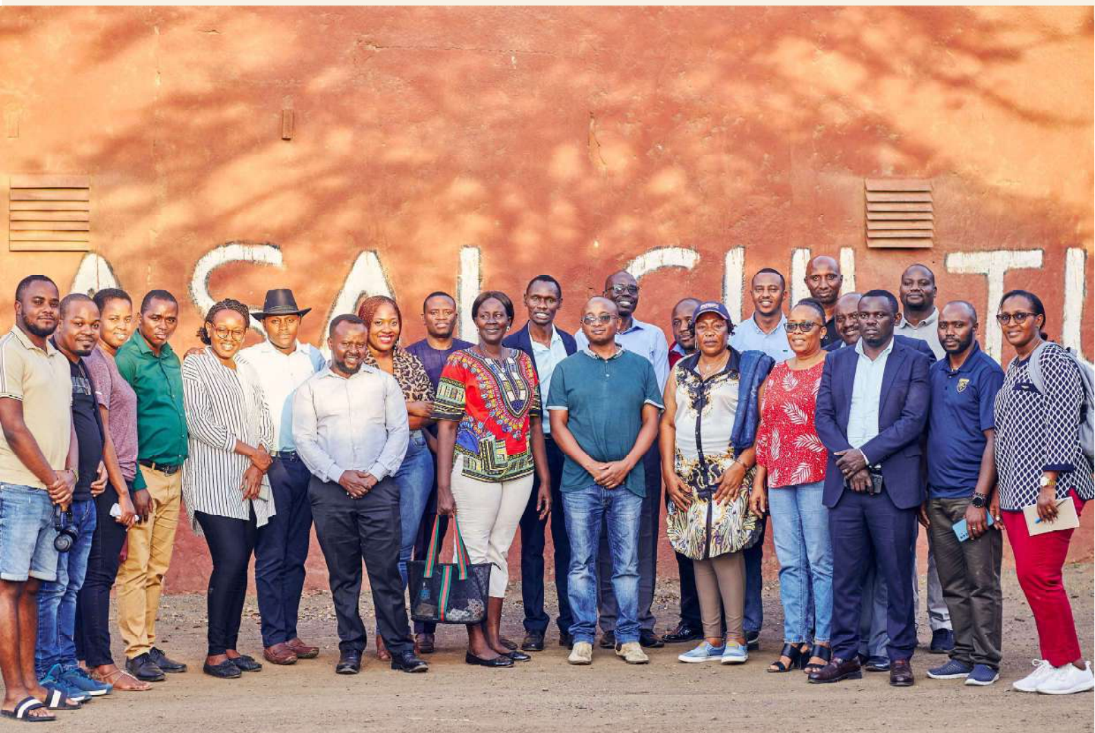
Group photo of participants from EAC Central Banks, Facilitators and Coordinators during a study tour at Snake Park Arusha, after EAC Central Banking course held at Arusha International Conference Centre(AICC), Tanzania

For more Information: Tel: 255 (028) 2500709 / 2500983 | Mob: +255 766 222 541 | Fax: +255 (028) 2500984