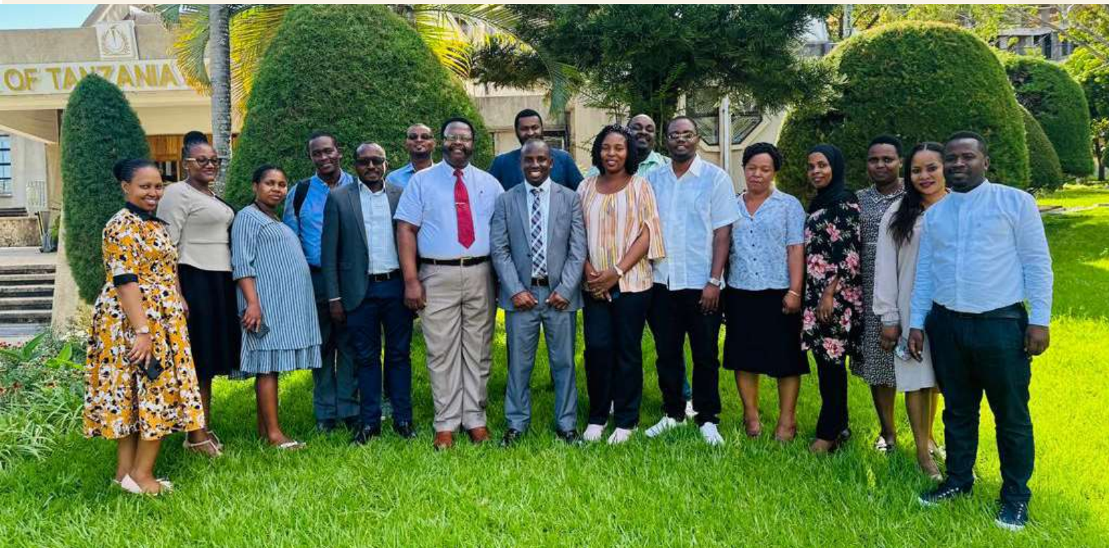
Participants from the Ministry of Finance who attended a training on business process management and financial analysis course held at BOT Academy in Mwanza Tanzania