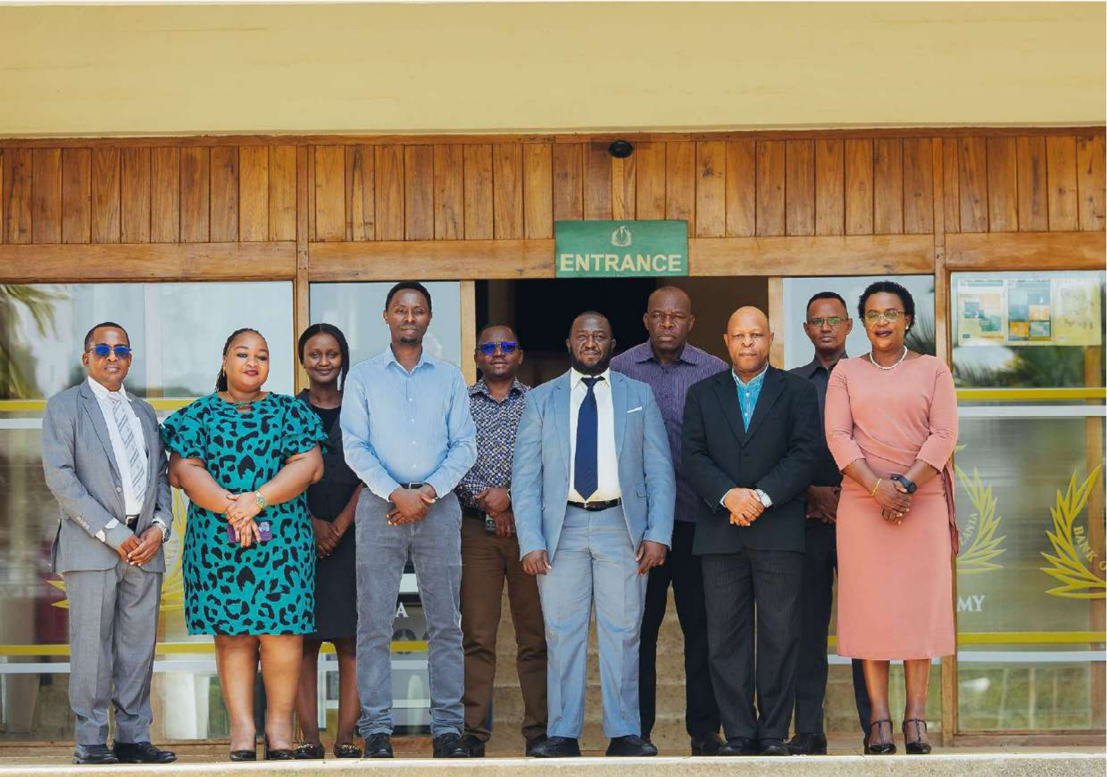
Group photo of the TCB Board Members and Senior Management, Facilitators and Coordinators during the Corporate Governance Course held at BOT Academy, Mwanza Tanzania

For more Information: Tel: 255 (028) 2500709 / 2500983 | Mob: +255 766 222 541 | Fax: +255 (028) 2500984