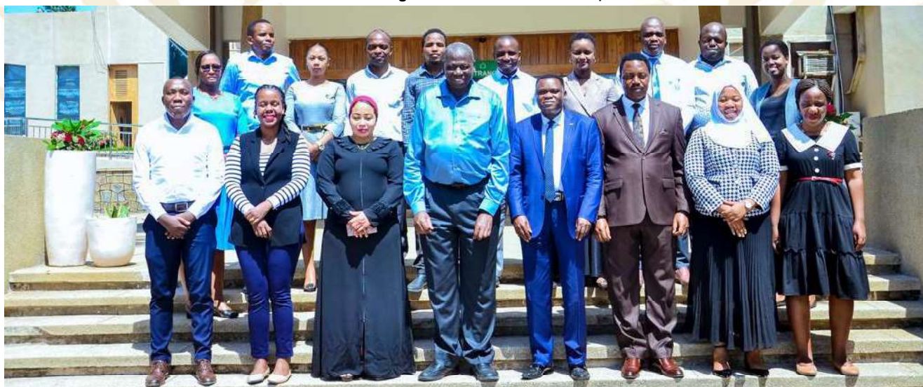
Group photo of Facilitator from Brock University, Canada, BOT Academy Lecturers and Participants from other institutions who attended a training on Research Methodology held at BOT Academy, Mwanza Tanzania

For more Information: Tel: 255 (028) 2500709 / 2500983 | Mob: +255 766 222 541 | Fax: +255 (028) 2500984