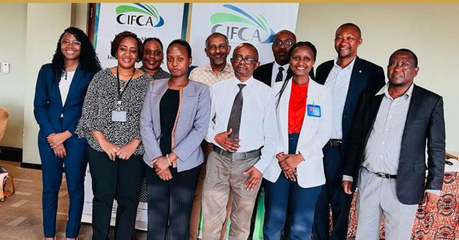
Group photo of facilitators and participants of the Islamic Banking Course held at BOT Sub-Head office in Zanzibar Tanzania

For more Information: Tel: 255 (028) 2500709 / 2500983 | Mob: +255 766 222 541 | Fax: +255 (028) 2500984